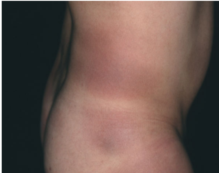
Fig. (3). Livid patches of morphea on the trunk. Culture of a skin biopsy was positive. B. afzelii was identified by PCR-RLFP analysis [111].

Morphea is a disease of heterogeneous origin occurring after vaccination, trauma, or insect bites; it can also be congenital [18]. Histologically, the early phase is associated with edematous swelling of collagen fibers, perivascular and interstitial infiltration of lymphocytes, monocytes, histiocytes, eosinophils and plasma cells, followed by collagen overproduction or atrophy [19]. Serup divided the connective tissue changes in morphea into fibril degradation and myxedematous, cell infiltration and fibrotic stages [20]. Upon electron microscopy, collagen changes include loss of their transverse striation, disintegration of fibers, elastoid transformation and complete collagen destruction [21].