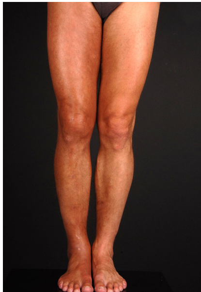
Fig. (5). Eosinophilic fasciitis arising in the context of Lyme arthritis of the knee on the same extremity.

Positive Borrelia serology and an association with LB were often reported in eosinophilic fasciitis/Shulman syndrome (Fig. 5) [73 - 78], with detection of a positive flagellin gene sequence by PCR in one patient [79]. In 4 cases of borrelial fasciitis, spirochetal organisms were identified by Dieterle and Steiner silver stains; one patient was positive with a rabbit polyclonal antibody; 2/4 patients were seropositive [80].