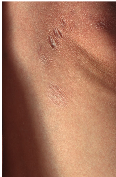
Fig. (6). Anetoderma at the border of an ACA lesion after antibiotic therapy.

Anetoderma is defined by a decreased amount of dermal elastic tissue and a variable amount of inflammatory infiltrate [87]. A patient with multiple oval skin colored macules with a wrinkled surface is reported. PCR analysis for the flagellin gene and genotyping were positive for B. afzelii . Strunk et al. reported another patient with positive IgM antibodies to B. burgdorferi and arrested progression of anetoderma after doxycycline [88].