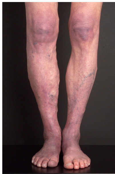
Fig. (4). Acrodermatitis with atrophic skin changes.

Histologically, ACA shows both a band-like subepidermal and a perineural cell infiltrate, atrophy of collagen with edematous or thinned collagen fibers, and fibrosis. There are no important differences between the lesional skin of ACA, fibrous nodules, ulnar bands or sclerodermatous changes [22]. Electron microscopy shows that elastic fibers are destroyed and collagen fibers are present with peripheral amorphous material in ACA [23], showing similarities to the