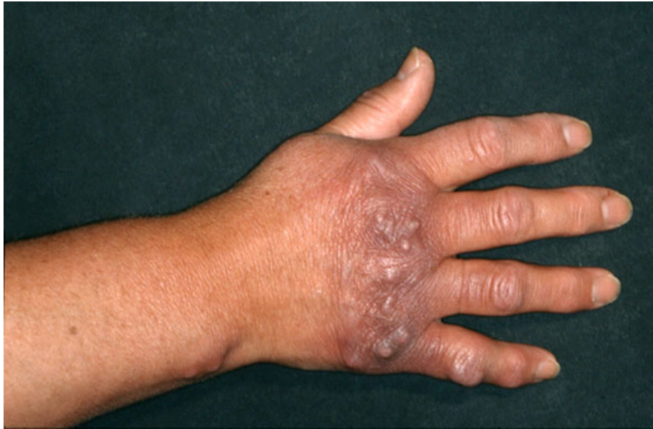
Fig. (1). Fibrous nodules in acrodermatitis chronica atrophicans.

seropositive morphea patients, Büchner et al. described 2 patients with a history of EM, 1 with coexisting ACA, and 2 with LSA [15]. In 1994 Trevisan et al. reviewed the association of B. burgdorferi and localized scleroderma [16].