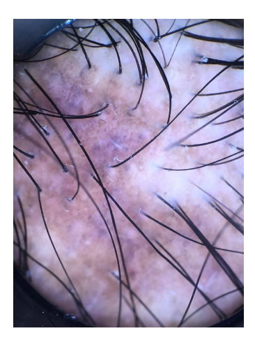
Fig. (1B). Dermoscopy showed Perifollicular whitish halo, follicular keratotic plugs and telangiectasias.

The patient did not have any history of trauma, and only one side of the scalp was affected. In contrast to this case, two similar case reports of linear DLE of the scalp had a facial extension [2, 5]. The patient had negative ANA and no other systemic manifestations of Lupus erythematosus as expected by majority with limited DLE [3].