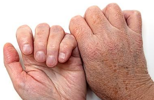
Fig. 1. Rough hands with chemical sanitizers.

C. albicans 31 ± 1.6 28 ± 1.4 21 ± 1.5 0 28 ± 1.4