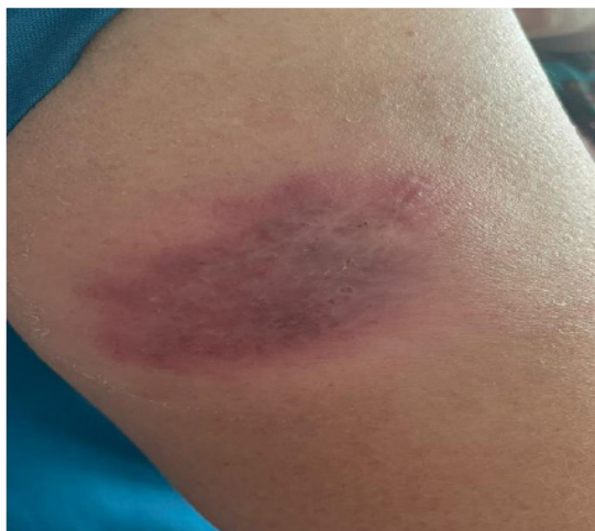
Fig. (5). Resolution of the lesion with residual hyperpigmentation.