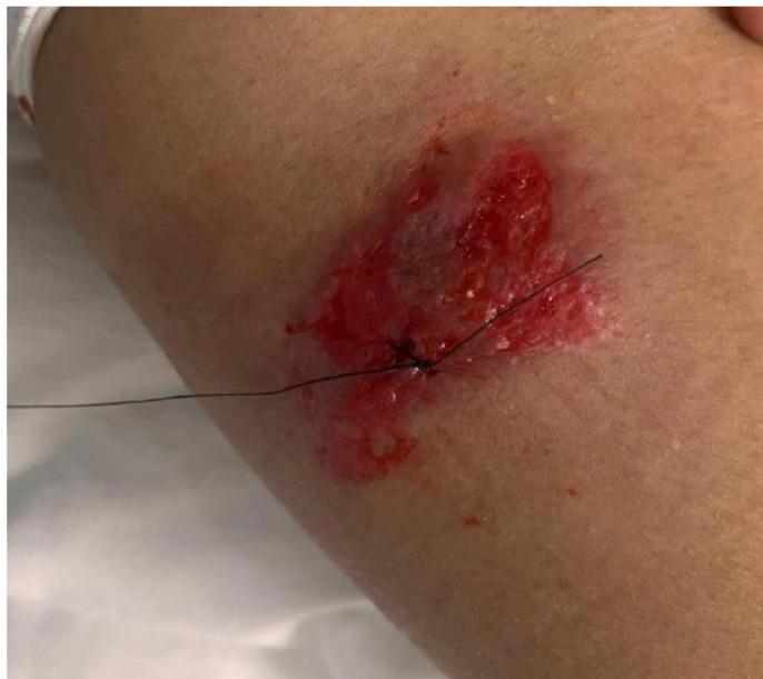
Fig. (1). A solitary tender non-indurated bright erythematous shallow ulcer.