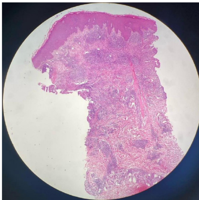
Fig. (2A). Low power field (X10).