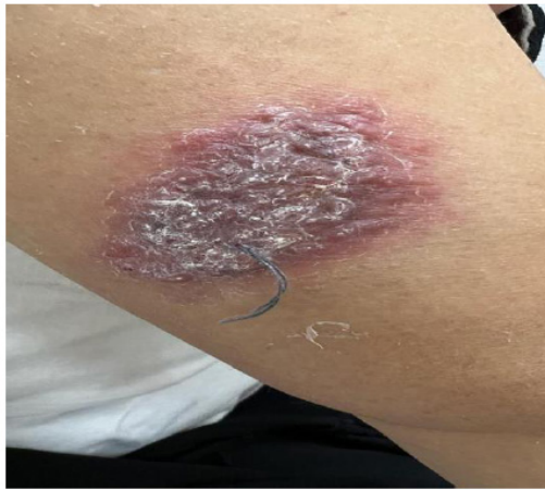
Fig. (3). Lesion improved after the initial course of treatment.