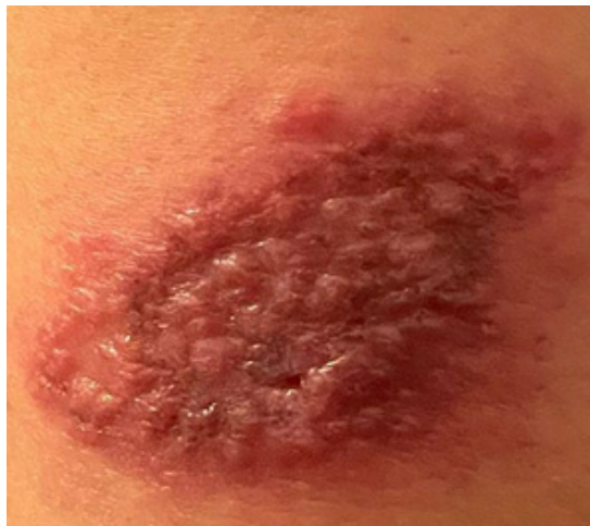
Fig. (4). The lesion relapsed due to contact dermatitis.