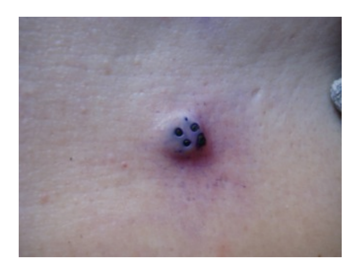
Fig. (1). Clinical presentation: four black keratinous plugs in the center of a nodule.

On clinical examination, the lesion was a 1.5 \times 1.6 cm, elastic-firm, comedo-like lesion with four black keratinous plugs in the center (Fig. 1). The curatively excisional specimen histologically showed a flask-shaped, cystic structure in the dermis filled with basket weave cornified debris (Fig. 2). The epithelial lining of the structure connecting to the surface epidermis was atrophic near the surface. Based on the clinical manifestation and pathological findings, the diagnosis of a dilated pore of Winer was made. To the best of our knowledge, a dilated pore characterized as four openings with keratotic plugs in one nodule has not been described previously in the literature.